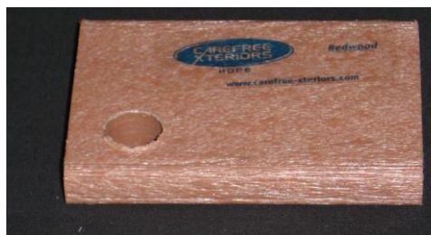
Synthetic Red-Wood Color Samples

REAR DECKS & TERRACES must be done with brick and limestone or constructed of synthetic materials in Redwood color only.